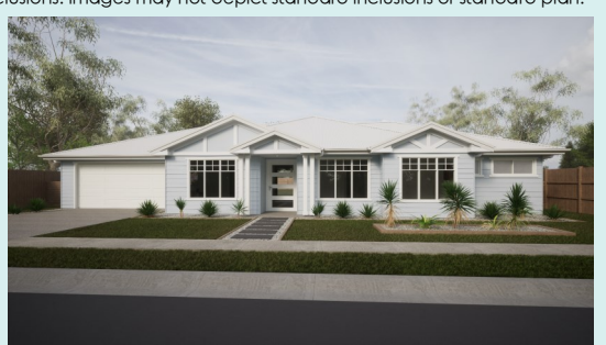
© COPYRIGHT 2024 PJ Burns Builder PTY LTD Plan shows standard inclusions. Images may not depict standard inclusions or standard plan.