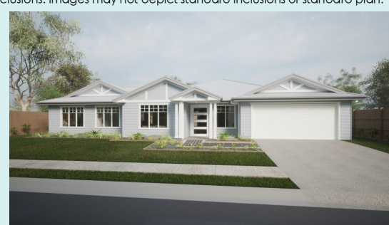
© COPYRIGHT 2024 P.J Burns Builder PTY LTD Plan shows standard inclusions. Images may not depict standard inclusions or standard plan.